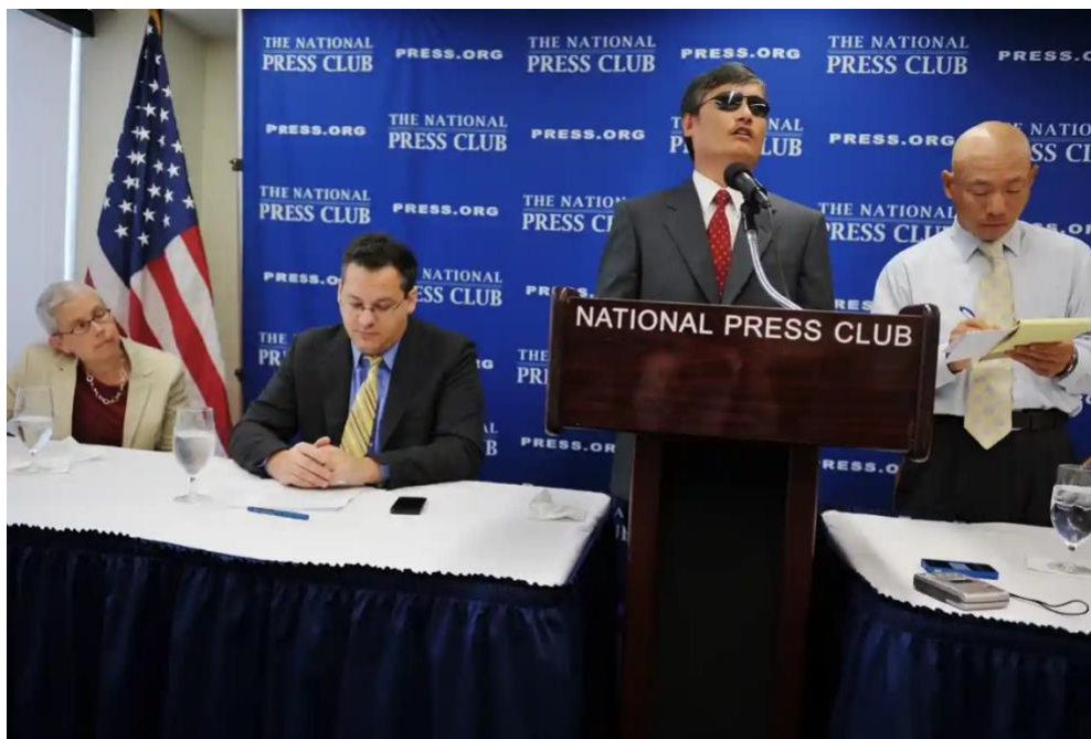
The Chinese dissident Chen Guangcheng speaks on China's treatment of dissidents and their families in Washington in 2013.